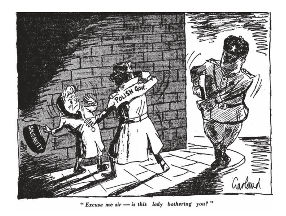
A cartoon published in Britain, 5 December 1980. The figure on the right represents Brezhnev.